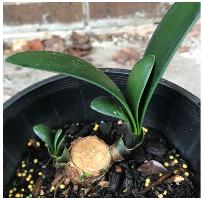
Fig. 10 Growing into offsets

Usually within a few weeks to months, you will hopefully see some tiny new green shoots coming from the sides of the stump. These will develop over time into offsets, and you may get two or three of these growing from one stump. Allow the plant to grow normally after this, and in time, you will have new plants.