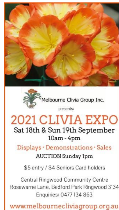
Fig. 3 Gardening Australia magazine