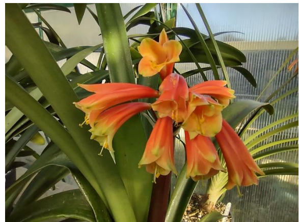
Fig. 19 Gardenii x ( Gardenii x Miniata ) #2