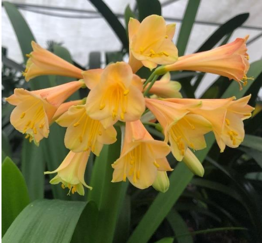
Fig. 12 Honeysuckle - Lisa Fox