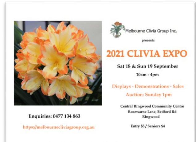
Fig. 2 Gardener's Gazette magazine published by the Royal Horticultural Society of Victoria. Photo is 'Leah' owned by Terry Edwards.

There are a number of advertisements for the 2021 Clivia Expo including the following: