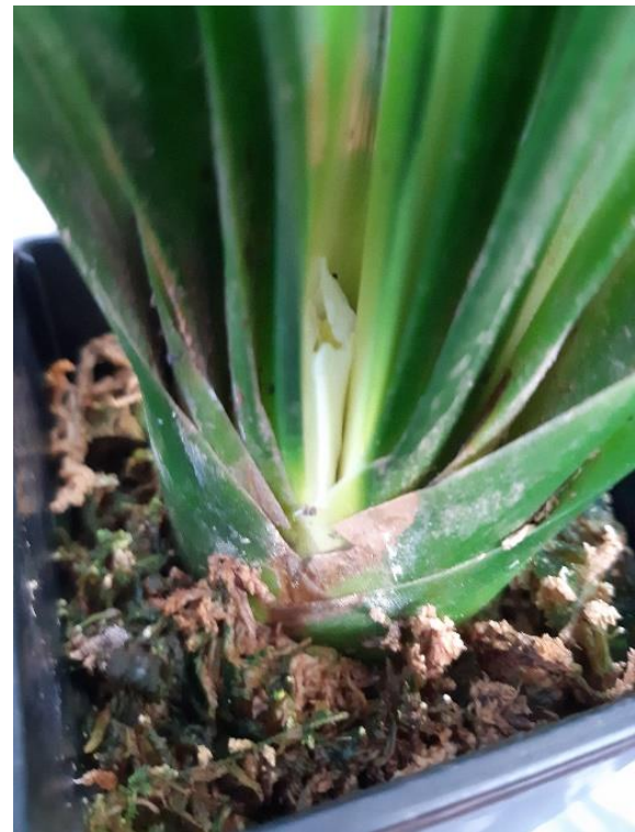
Fig. 5 Plant budding in Sphagnum Moss

It makes me wonder how important the growing medium really is!