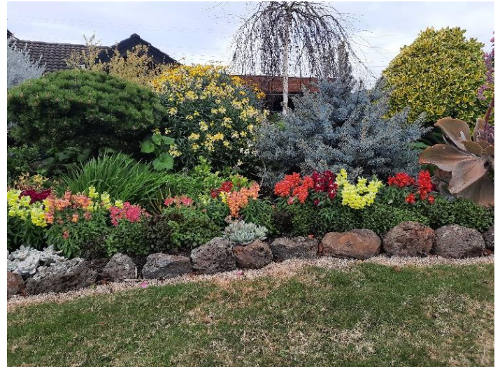
Fig. 6 Allan's colourful garden

The following photos are a taste of what we missed out on.