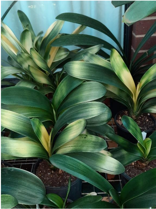
Fig. 8 A lovely selection of variegates