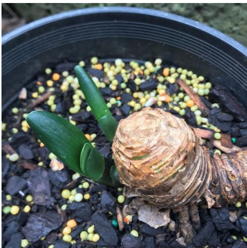
Fig. 9 Growth from the stump

It seems to be Murphy's Law that it will inevitably happen to one of your favourite plants!!