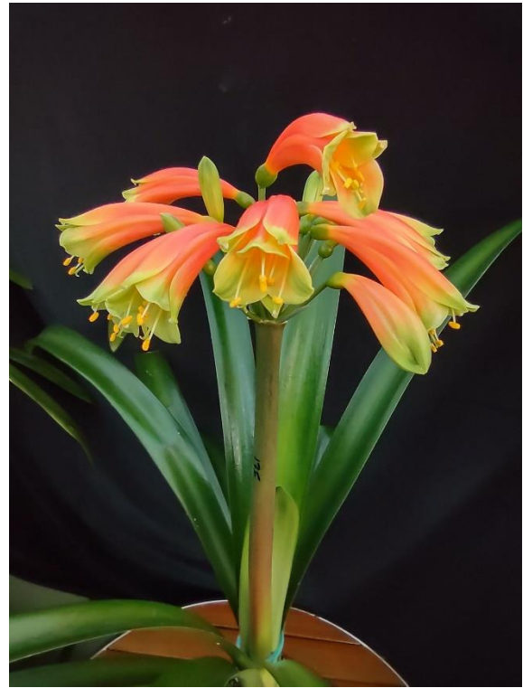
Fig. 18 Gardenii x ( Gardenii x Miniata ) #1