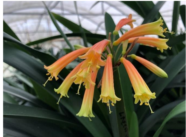
Fig. 15 Sophia - Lisa Fox