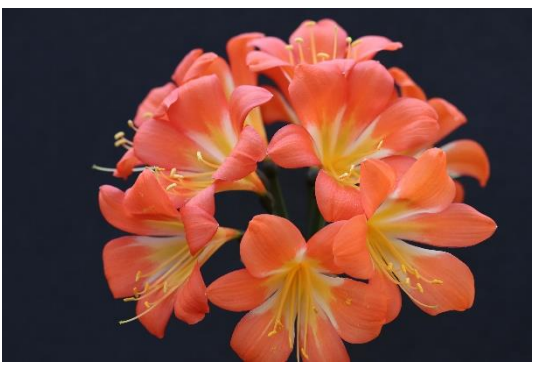
Figure 14 Ndwedwe Jade x Super Jade – B. Girdlestone