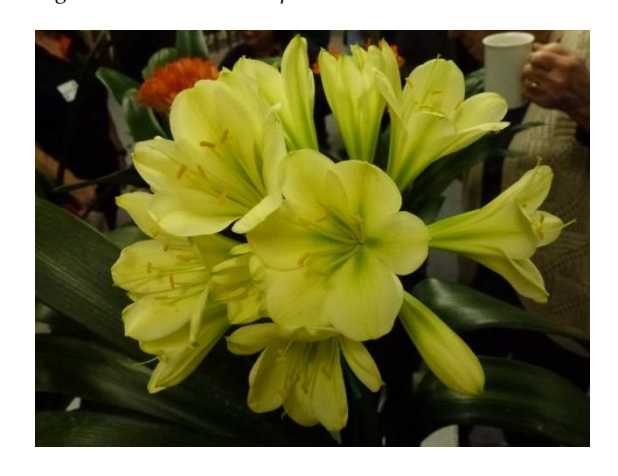
Fig. 4 A lovely Group 2 plant auctioned