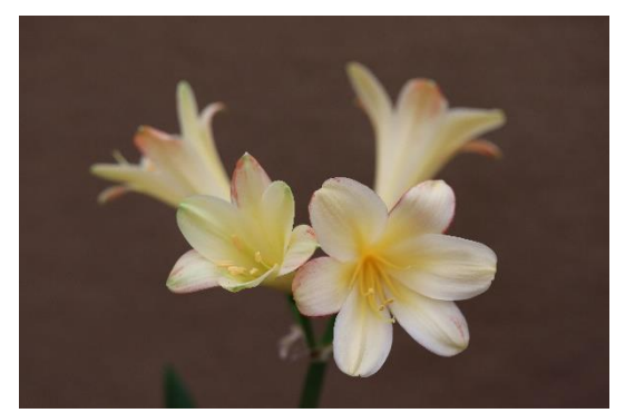
Fig. 10 'Fabulous'x 'Wild Dog'- B. Girdlestone