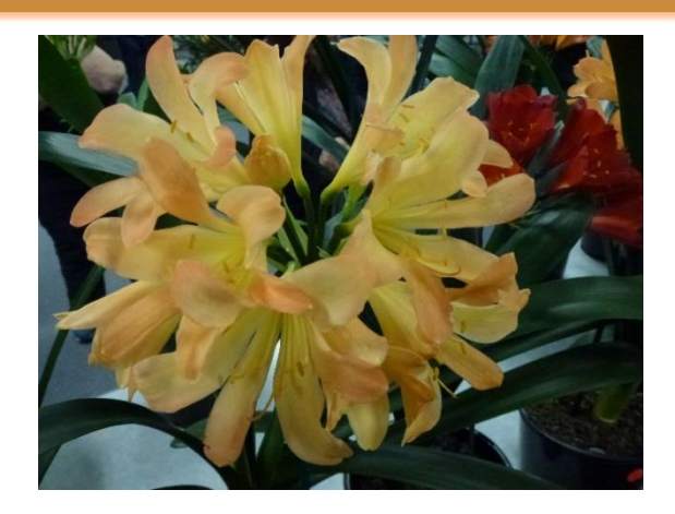
Fig. 5 One of 3 Apple Blossoms auctioned