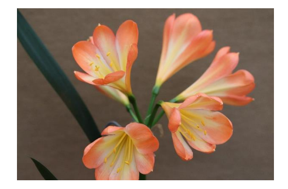
Fig.\ 13\ Yellow\ x\ Mambo-B.\ Girdlestone