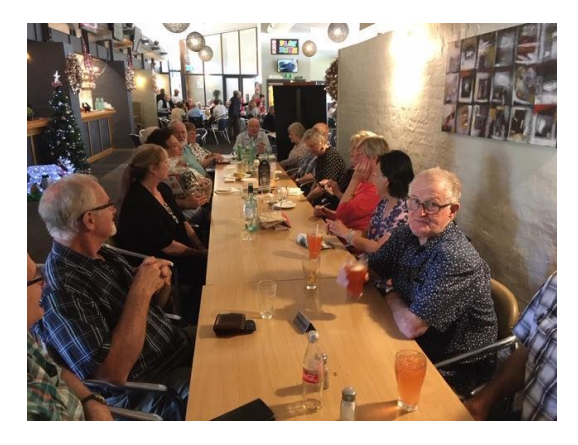
Fig. 9 Lunch at the Burvale Hotel