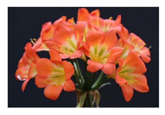
Fig. 12 Ndwedwe Jade x Super Jade – B. Girdlestone