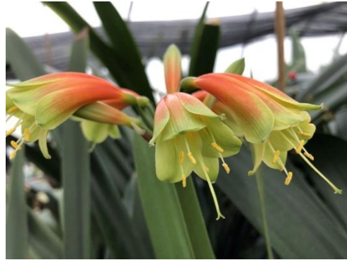
Fig. 8 'Green Imp'