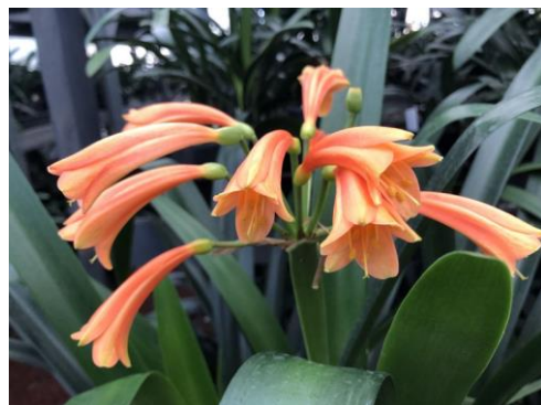
Fig. 10 Nakamura Interspecific