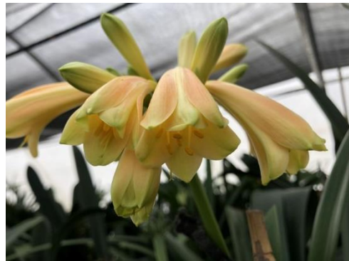
Fig. 9 Buff x Ngome Yellow Gardenii