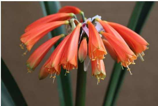
Fig. 6 'Flame' bred by Bill Morris