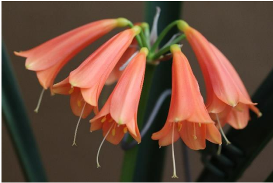
Fig. 5 Chubb Peach x C. gardenii sibling cross