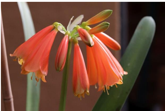
Fig. 7 C. nobilis hybrid