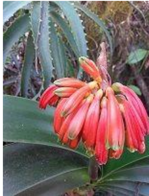
Fig.5 C. Caulescens in habitat

Still with my backpack on and holding the camera, and tablet, I had to heave myself up part of the rock face to find the right position for my dream photo. Once up and in position, I found I then had another problem, the sun. Not to be out done by this, I held my hat up to block out the sun while still balancing and keeping my footing, I was then able to take my photo, and just to be sure I didn't waste the moment I took a photo with my tablet and then my phone.