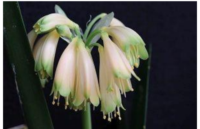
Fig.7 (( C. Miniata x C. Nobilis ) X C. Nobilis ) x ( C. Robusta x C. Caulescens )