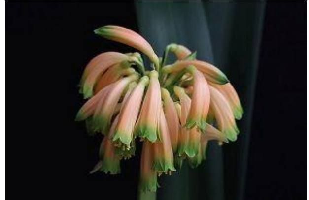
Fig.6 C. Robusta x C. Caulescens

My first flower for 2019 is an Interspecific, C. Robusta X C. Caulescens which has flowered previously in May two years ago. This year it's flowering early, not sure if this is due to the warmer weather or not.