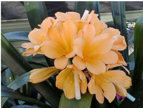
Fig.4 (New Dimension x Sunset) x Expectation Peach

I have acquired around 160 plants and I have been pollinating and growing my own seedlings for the past several years. I grow my plants under shade cloth and also use a poly-carbonate green house. I have switched to using a hydroponic potting mix and nutrient solution over the past 2 years. My collection is kept in pots however I have a small number in the ground. I have started to do some line breeding but still working out what direction I am going in with my Clivia . One of my favourites is (New Dimension x Sunset) x Expectation peach which has large 11cm wide flowers and I am line breeding to other plants with Sunset breeding.