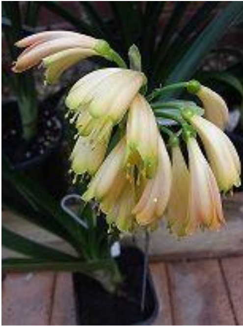
Fig.8 (( C. Miniata x C. Nobilis ) X C. Nobilis ) x ( C. Robusta x C. Caulescens )

as it ages it does have some blush, but just before the flowers age and start dropping off it develops a pinkish/orange hue around the edges of the petals.