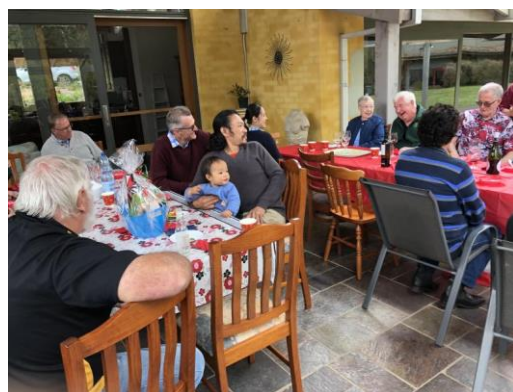
Fig 15 – Christmas function