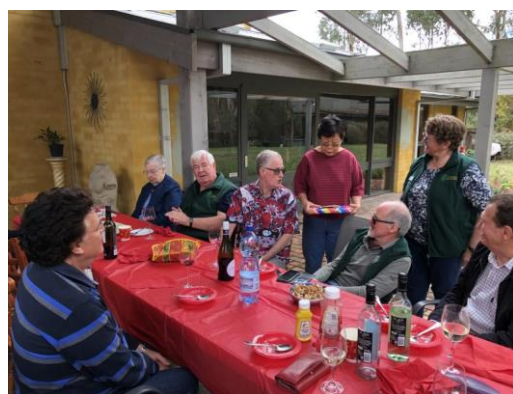
Fig. 14 – Christmas function