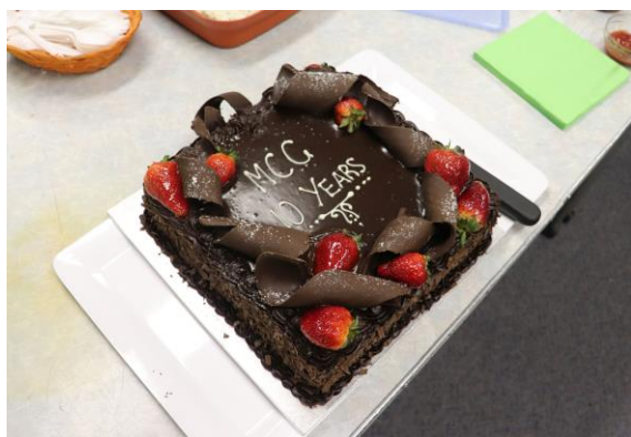
Fig. 10 – 10 year celebration cake

The October 10 year celebration was well attended by past and present members. See more photos on the MCG website gallery - http://www.melbournecliviagroup.org.au/gallery/gallery-2018-october-10-year-celebration/