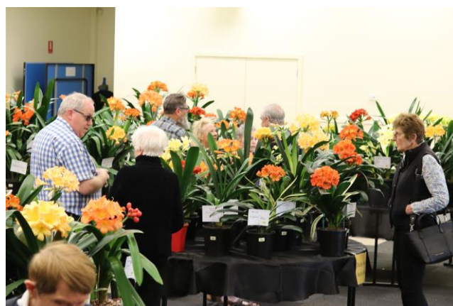
Fig. 3 – CLIVIA EXPO display

There was a steady stream of visitors through the door all day with a rush of people in the morning for the sales plants. Sales were well represented by four individual sellers plus the Trading Table. Visitors enjoyed the display plants, the floral art, demonstrations, raffle, and took advantage of the relaxing atmosphere, enjoying coffee, tea, cake or sandwiches surrounded by a mass of coloured flowers. We were very pleased to see a good number become members on the day and we look forward to welcoming these new members to meetings.