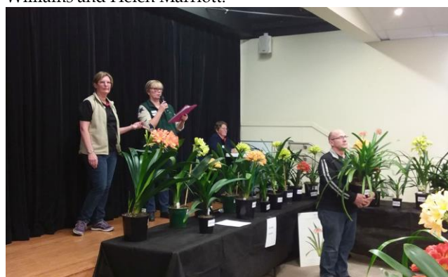
Fig. 4 – Auction in progress

We held a live auction of 26 quality plants and one Clivia print. A crowd gathered for the event and bidding was constant and at times, fierce. The auction is an opportunity for members of the public to bid on rare plants that are generally not available, and it was great to see the public bidding and winning plants, not just the enthusiasts. The winning prices varied between $55 and $320 with the highest price being paid for the well-known peach, Comet . Five green flowering plants ranged from $150 to $280 proving to still be very popular with the public. A few well-bred red bronze flowering plants ranged from $130 to $200 and offsets of Sir John Thoroun , The Artist and a yellow C. caulescens reached into the $200s. A few lots were passed in and several sold after the auction. Two lots were very kindly donated to the Melbourne Clivia Group by Hugh Williams and Helen Marriott.