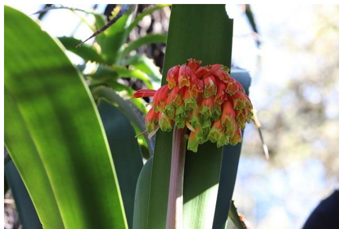
Fig. 7 - Gods Window

So, on Monday the 10th at 7.00am we met up with our fellow travellers at Pretoria. After introductions and travelling arrangements were sorted, we hit the road with a total of twelve people and three vehicles. After stopping along the way for breakfast, we reached Graskop, where we booked into our accommodation and collected lunch packs which were pre-arranged and set off again to visit God's Window. After a short hike, we were rewarded with an outstanding view, although being hazy you could see for miles.