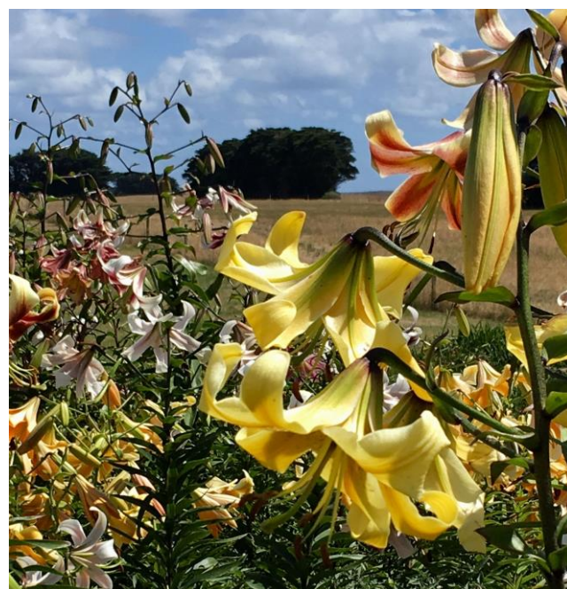
Fig 2 - Liliums

AGM is next month. To paraphrase the famous words of President J.F. Kennedy from his inaugural address, "ask not what your MCG can do for you – ask what you can do for your MCG". We all seem to enjoy the social aspect of the meetings and the expo, so I hope there will be some nominations without broken arms, please! Also, please renew your membership online and pay with bank transfer before the night of the meeting. Once all the formal matters are concluded I trust we can all enjoy a good chat and delicious supper.