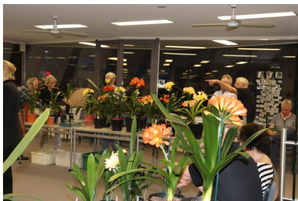
Fig 12. Plant display