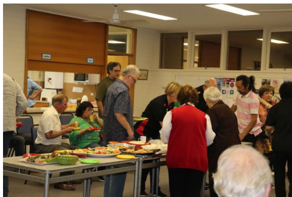
Fig 11. Supper