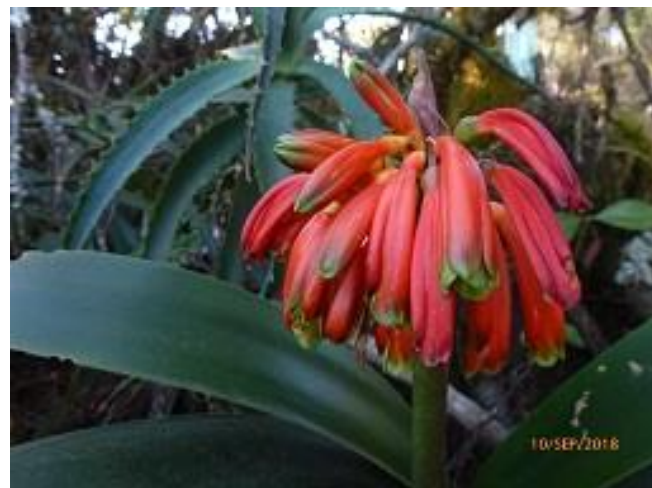
Fig 9 - At Mariepskop

The habitat tour is one the I will remember and glad to have been able to take part to see the Clivia growing in the natural surroundings, coping with whatever nature throws at them. This is a tour that would be highly recommended for anyone thinking of attending future conferences.