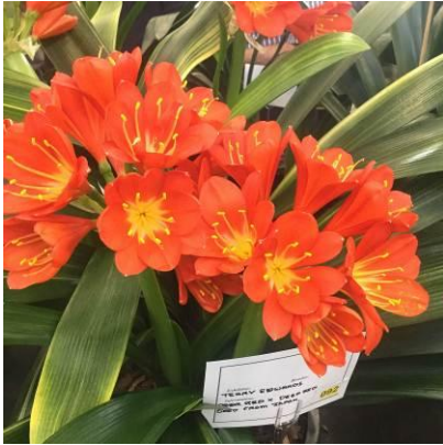
3 rd place, Terry's brilliant red.

3 rd place went to a specimen tub with a number of variegated offsets, brilliant red flowers, some flowers being multipetals, of Japanese origin.