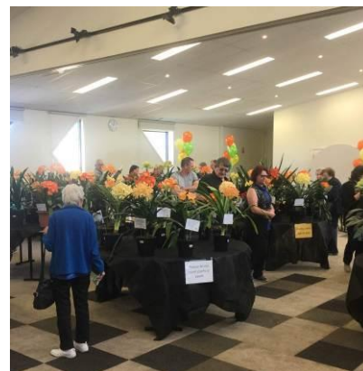
The main hall full of colour and light.

The hall was set up on the Friday night, with about half of the plants arriving for display, with the remainder being delivered and registered early on the Saturday. Overall there were 141 pots exhibited, from 13 members. Round tables were used for the display, some members filling a table (or two) while other shared a table. As has been the case with every MCG expo, information cards were completed to add context and understanding to the plants