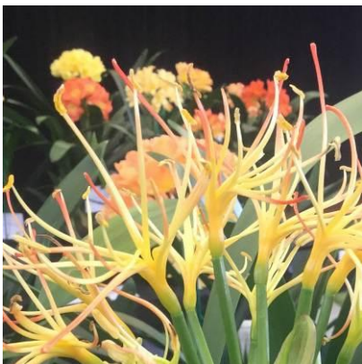
'Frats' brought over by Alan from South Australia to be part of the expo display.

Impossible as it is to mention all the wonderful exhibits, including a number of green and yellow green Clivia , excellent European Peach and bronzes, two talking points were a 'Frats' type displayed by interstate member, Alan O'Leary, and a interspecific with C. mirabilis as a pollen parent, displayed by Helen Marriott.