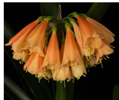
Fig. 3 C. miniata variegated x C. nobilis

Increase the shutter speed and/or increase the ISO (which will allow you to further increase the shutter speed).