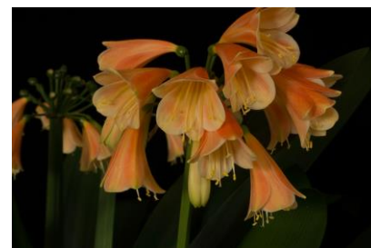
Fig. 4 C. miniata x C. caulescens

We have noticed a trend at recent MCG meetings for members to rely on their phone cameras. While I believe it is the case that the cameras in phones are improving and that we can expect these to further improve, it seems that the cameras in smart phones have replaced the introductory level compacts only, and remain more limited in the control we can exercise over the settings than is the case with most other cameras available, including most compact cameras. So while phone cameras can be extremely useful when no other camera is available, if you have another camera option with the greater ability to control the settings, then please don't give up on the latter at this point in time.