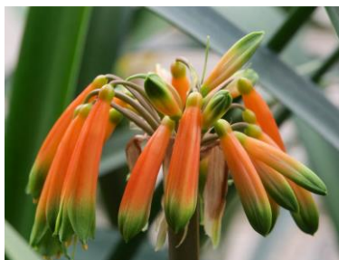
Fig. 2 C. gardenii

Nick will send the offsets in mixed allotments but says they these plants were described/named by Val Thurston as follows: Gardenii Sonkomo Region, Gardenii Ndwedwe Alpha Region, Gardenii Ndwedwe Msubo Region, Super Gardenii (from Best on Show), Gardenii Midlands Super, Gardenii Super Ndwedwe Region, Gardenii Kranskop Region, Gardenii Ndwedwe Sonkomo Region, Gardenii Everton Region, Gardenii Everton/Krantkloof Region, Gardenii Inanda Region and 'Green Goblin' x 'Gremlin'.