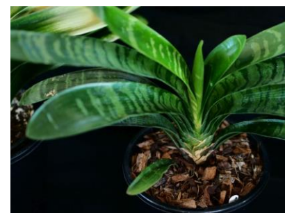
Figure 6 Tiger variegated plant exhibited by Terry Edwards

Following discussions after last year's CLIVIA EXPO, the sub-committee agreed to trial a combined Trading Table for CLIVIA EXPO 2014. The format was a larger scale of the Trading Table conducted at each general MCG meeting. One of the reasons for the change was to free up many of the MCG group members from manning their individual trading tables all day so that they could provide support to other activities during the day.