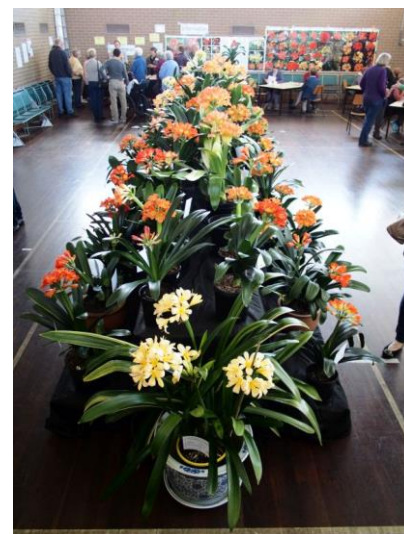
Figure 8 Flower display

Each year within a couple of weeks of the main event, the CLIVIA EXPO sub-committee conducts a feedback meeting to evaluate that year's planning and implementation, and as a means of improving our processes makes recommendations which is made available to the following year's planning group. This year's meeting will have already taken place by the time this newsletter is distributed but further comments and suggestions for improvements will be gratefully accepted from members over the coming weeks. Accordingly, this year's sub-committee's report and recommendations will be passed on to the 2015 planning group, which can be expected to start work in May of that year.