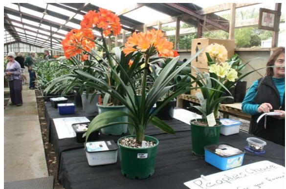
Tauranga Show - Above

One of the benches was set up with a small number of plants covering the clivia colour spectrum, and this was a chance for visitors to select their preferred colour, placing a copper coin in the adjacent box for the plant. Not surprisingly, the choice of the people was a Green Hirao.