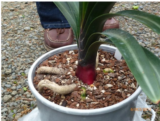
Mirabilis – Left

After breakfast we all boarded the bus bound for Keith Hammett’s property. On entering the property we were greeted by a large display of mass plantings of clivia as we walked along the driveway, passing the pond and up to the house, where we were met by Keith. After introductions and a brief background of the property, we were then led on a guided tour of the gardens. The gardens are all planted out in colour co-ordinated beds with tags on each planting including date, seed batch, and also including any crossing done. Keith also keeps these records on a computer, and has written copies as back-ups.