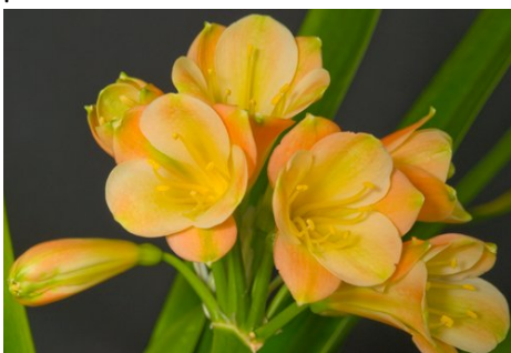
A beautiful interspecific bred by Laurens Rijke