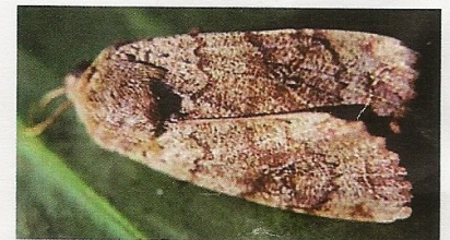
Tiracola plagiata adult

Editor's note: See Metamorphosis Australia No. 55, "The First Record of Tiracola plagiata feeding on Pararistolochia praevenosa " by Hilton Selvey.