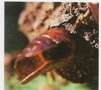
Empty pupal case

In late winter of 2010, while inspecting damage to my Clivia plants, I captured several caterpillars and reared these to adult moths. Different foods were used as an experiment. Clivia, rose, banana skins and capsicum were devoured.