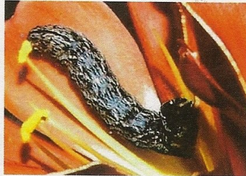
Tiracola plagiata larva on Clivia

Unfortunately there were two species of Lepidoptera, Brithys crini and Spodoptera picta that can be destructive pests of plants within the Amaryllidaceae family. Now there are three.