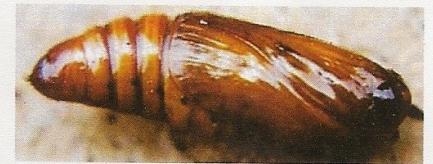
Tiracola plagiata pupa